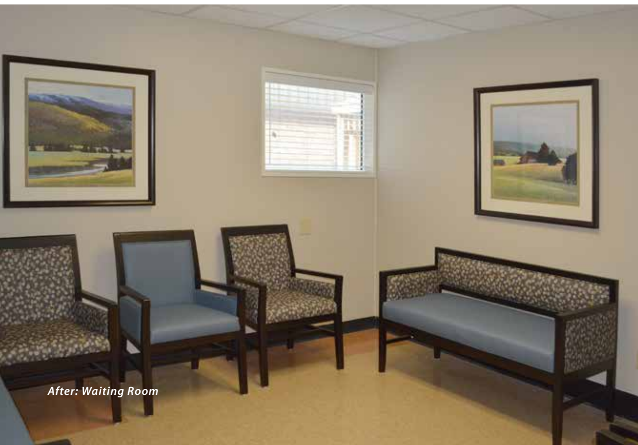
After: Waiting Room