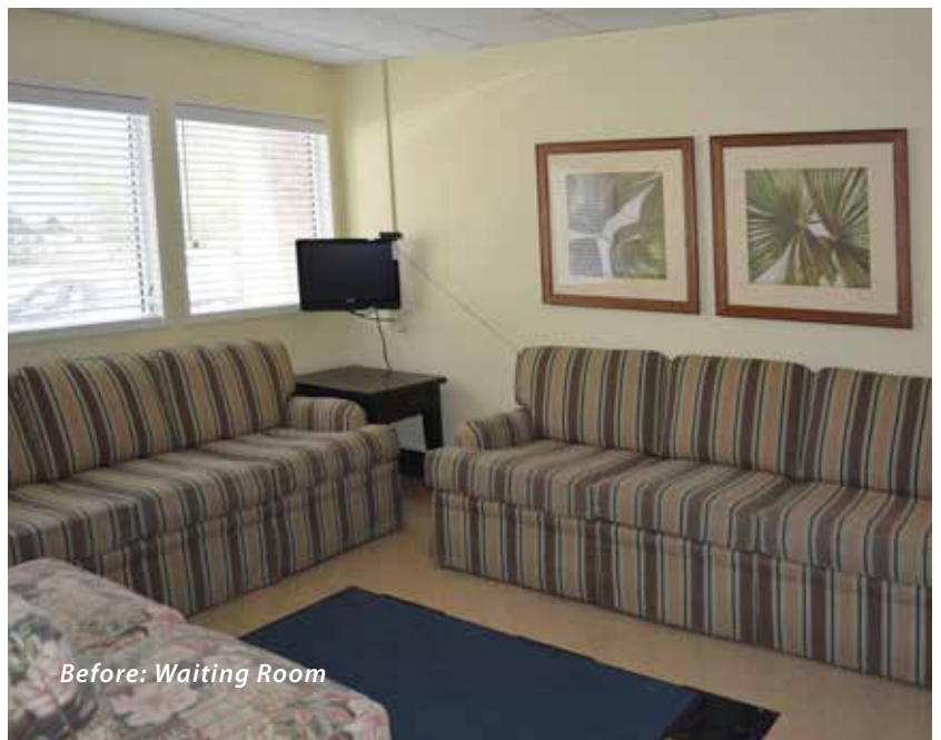
Before: Waiting Room